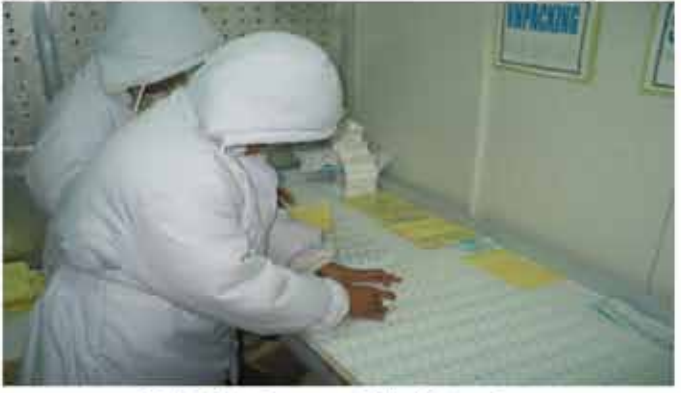
Cold Chain capability following global standards.

Fast order to delivery nationwide through an integrated network of regional distribution centers