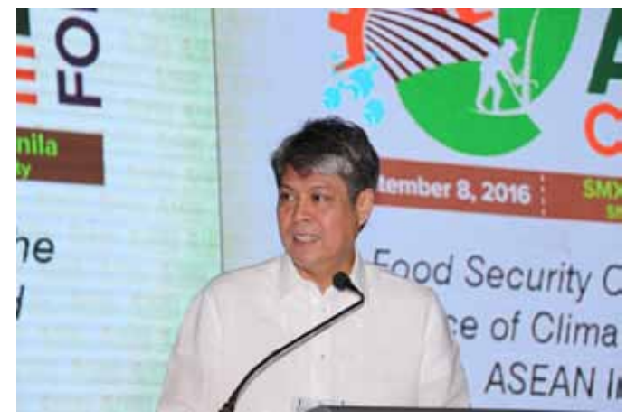
Senator Francis Pangilinan, Chair, Senate Committee on Agriculture, addressing the delegates of the first Smart Agriculture Forum, September 8, 2016.

The event was attended by 250 delegates from the government, companies, International organizations, NGOs, academe, and Embassies.