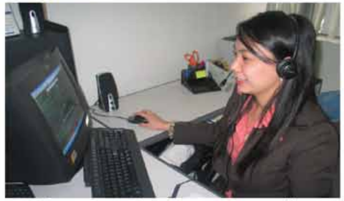
Customer requirements are supported by a customer call center and 22 sales service offices.