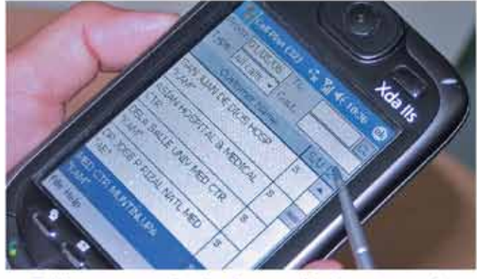
Fully automated sales force call planning and order-taking systems. Customers can also order anytime via on-line ordering systems.